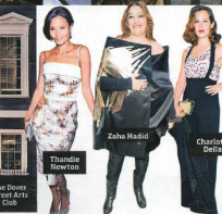
The Duke of Edinburgh Arts Club