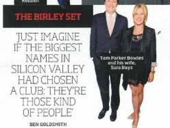
THE BIRLEY SET

JUST IMAGINE IF THE BIGGEST NAMES IN SILICON VALLEY HAD CHOSEN A CLUB: THEY'RE THOSE KIND OF PEOPLE